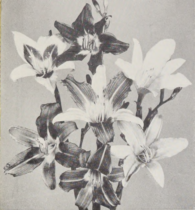
DAYLILIES NOW IN VARIED COLORS AND MARKINGS